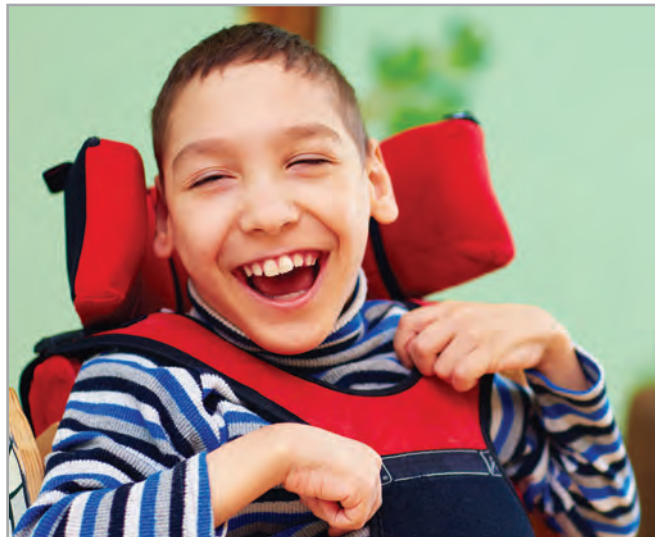
Child with cerebral palsy