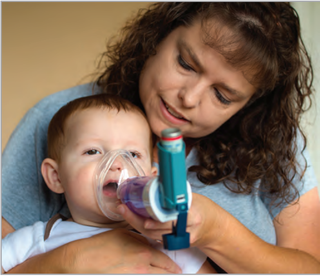
Administering quick-relief medication